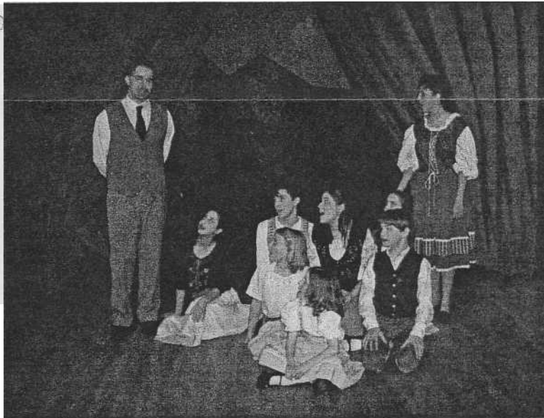
The von Trapp family in a scene from The Sound of Music . (story continued on page 2)