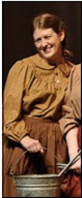
Valerie in a scene from Quilters

ABC Players will miss you all, and we wish you all the best in your future endeavors, both on and off stage.