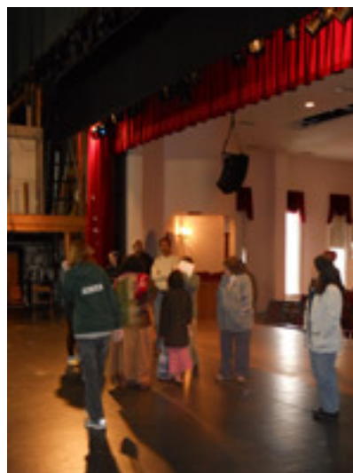
On the Stuart's Opera House stage, participants check out the flats, plugs, and other set construction elements available for use.